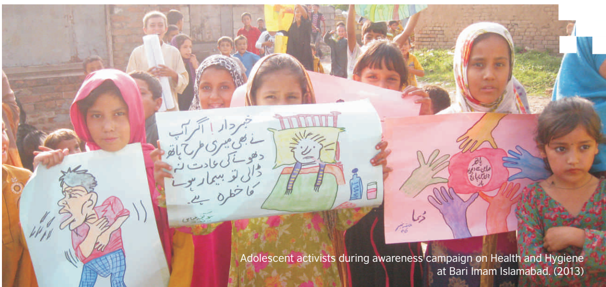
Adolescent activists during awareness campaign on Health and Hygiene at Bari Imam Islamabad. (2013)

AFCs (Adolescent Friendly Centres) are the hub of project activities being undertaken at community level. RHIA has empowered adolescents' girls and boys, women and men to take self initiatives and gain self confidence. It has provided them access to knowledge and skills and has improved access to reproductive health services. Such activities enable adolescents to act with a sense of responsibility, assertiveness, confidence and active citizenship.