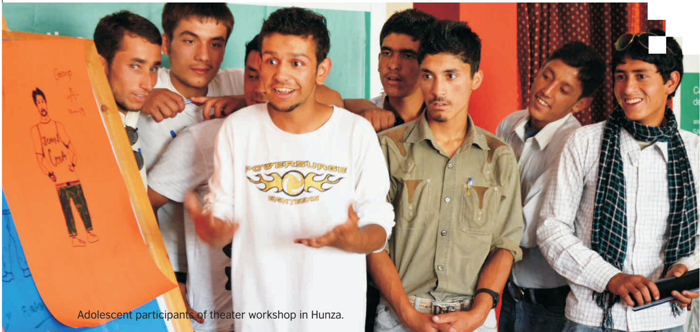
Adolescent participants of theater workshop in Hunza.