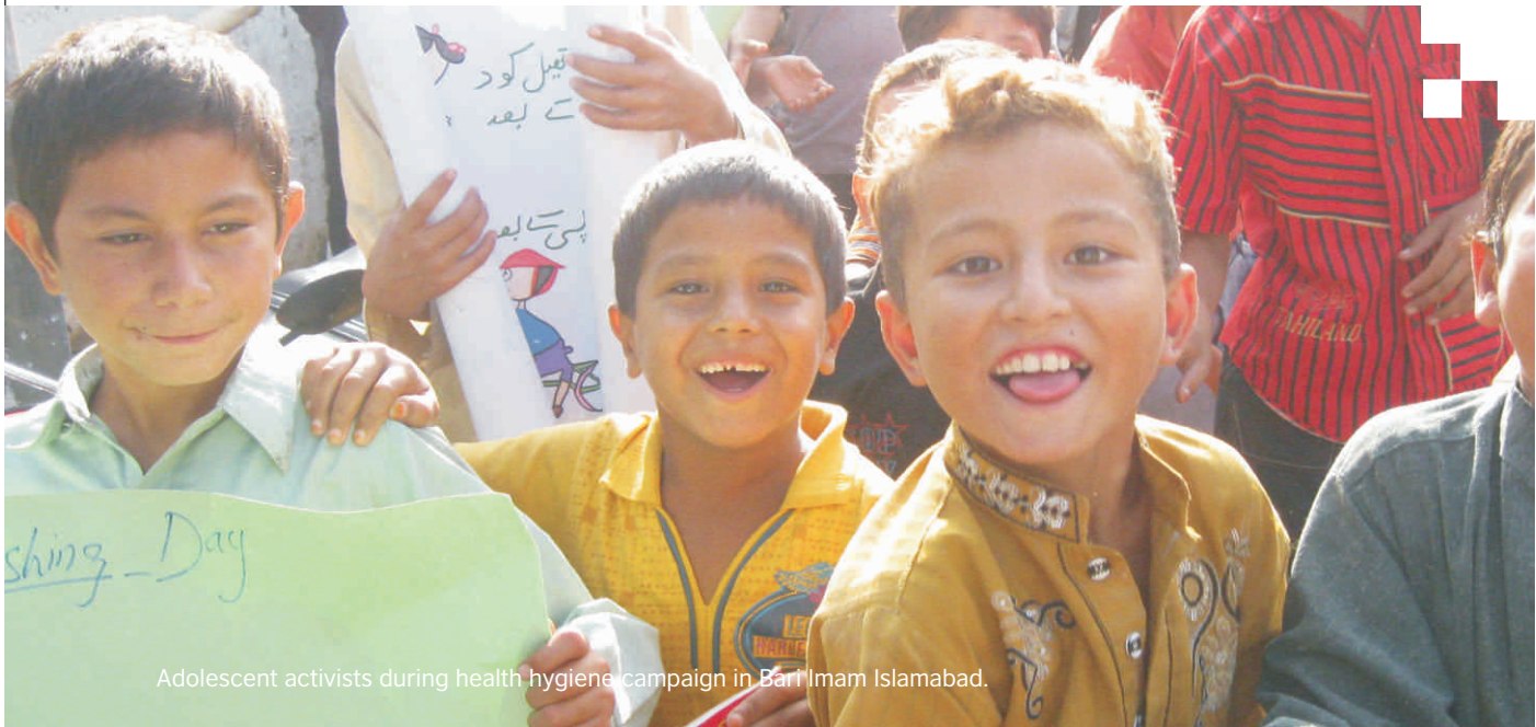
Adolescent activists during health hygiene campaign in Bar Imam Islamabad.