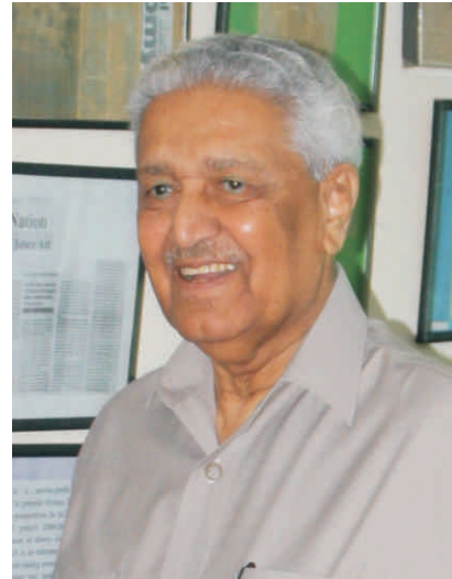
Dr. A.Q.Khan, NI & Bar, HI Founder President SACHET Pakistan

As this report indicates, SACHET now solicits support to endow donations and grants from individuals, institutions and local government to maintain and step up its efforts. We are grateful for all the help we have been receiving thus far.