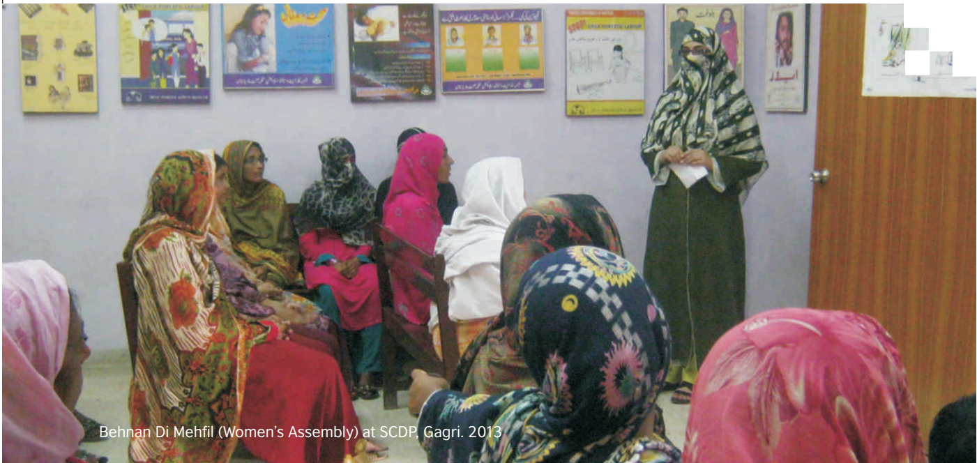
Behnan Di Mehfil (Women's Assembly) at SCDP, Gagri, 2013