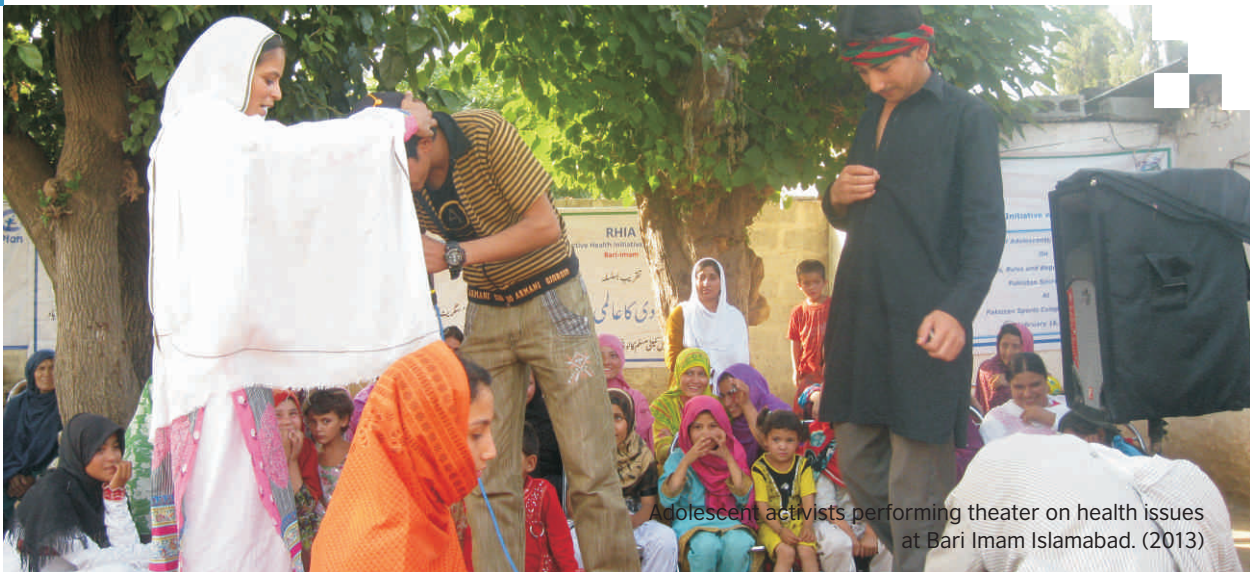
Adolescent activists performing theater on health issues at Bari Imam Islamabad. (2013)