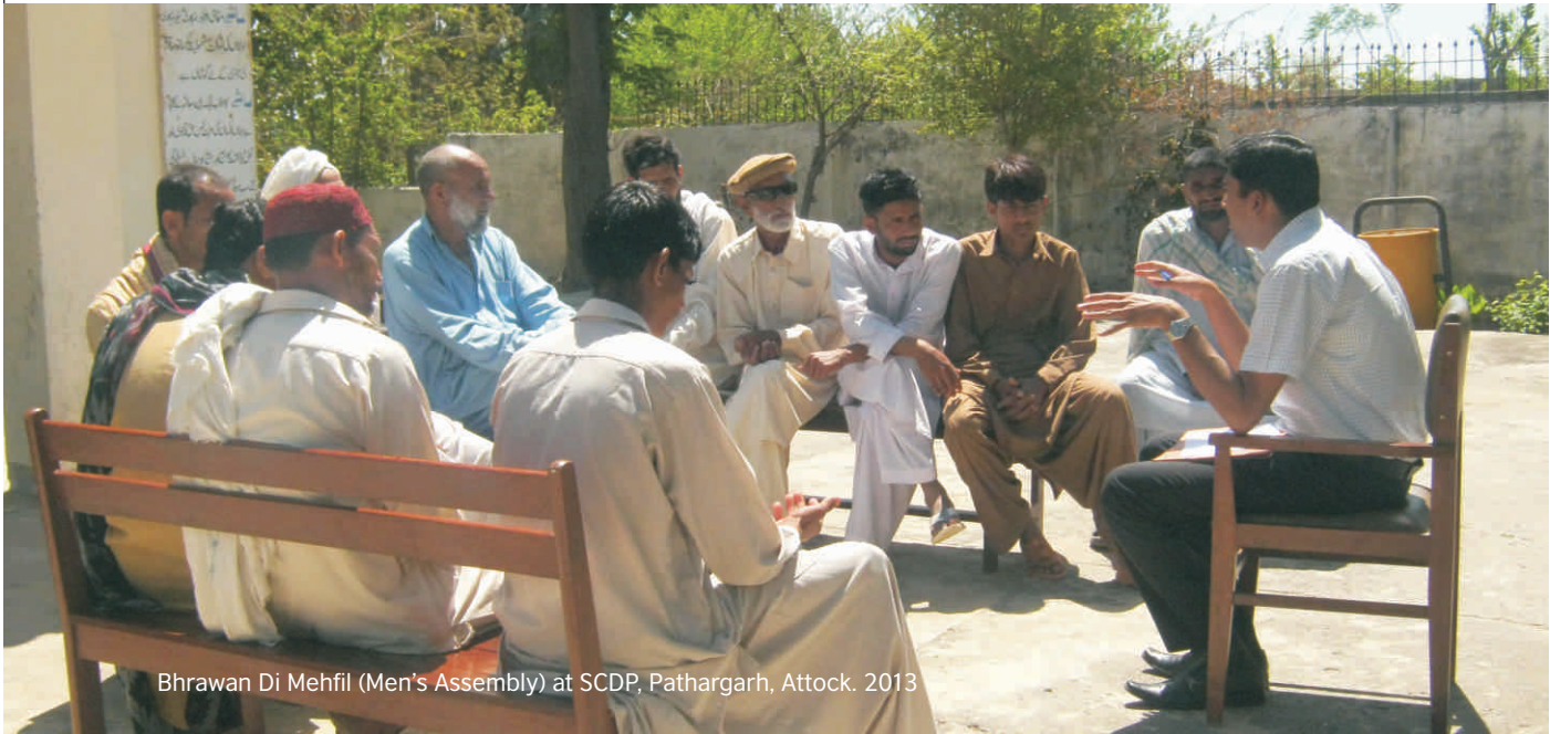
Bhrawan Di Mehfil (Men's Assembly) at SCDP, Pathargarh, Attock. 2013