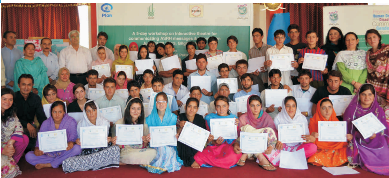
Participants of theater workshop with their certificates during the closing ceremony in Hunza.

The training ended in a formal closing ceremony which was attended by chairs of LSOs (local support organizations) of AKRSP and officials from Health Department of District Hunza-Nagar, Government of Gilgit Blatistan.