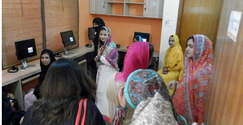
Inauguration ceremony of SACHET Computer Literacy Centre for Girls in Pathargarh, Hasanabdal District Attock held on May 30, 2015.