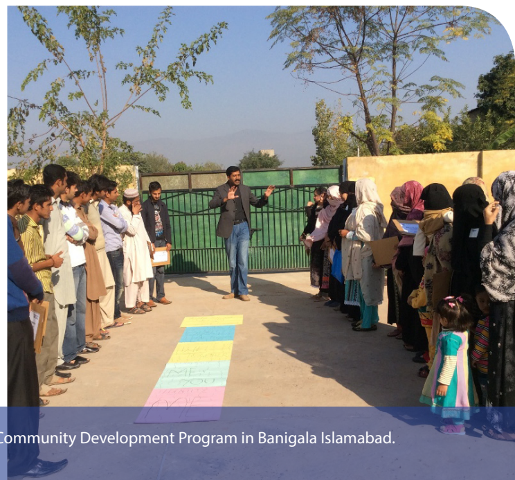
Trainees of Active Citizen Program during training workshop at SACHET Community Development Program in Banigala Islamabad. [SACHET2015]