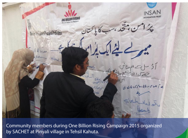
Community members during One Billion Rising Campaign 2015 organized by SACHET at Pinyali village in Tehsil Kahuta.