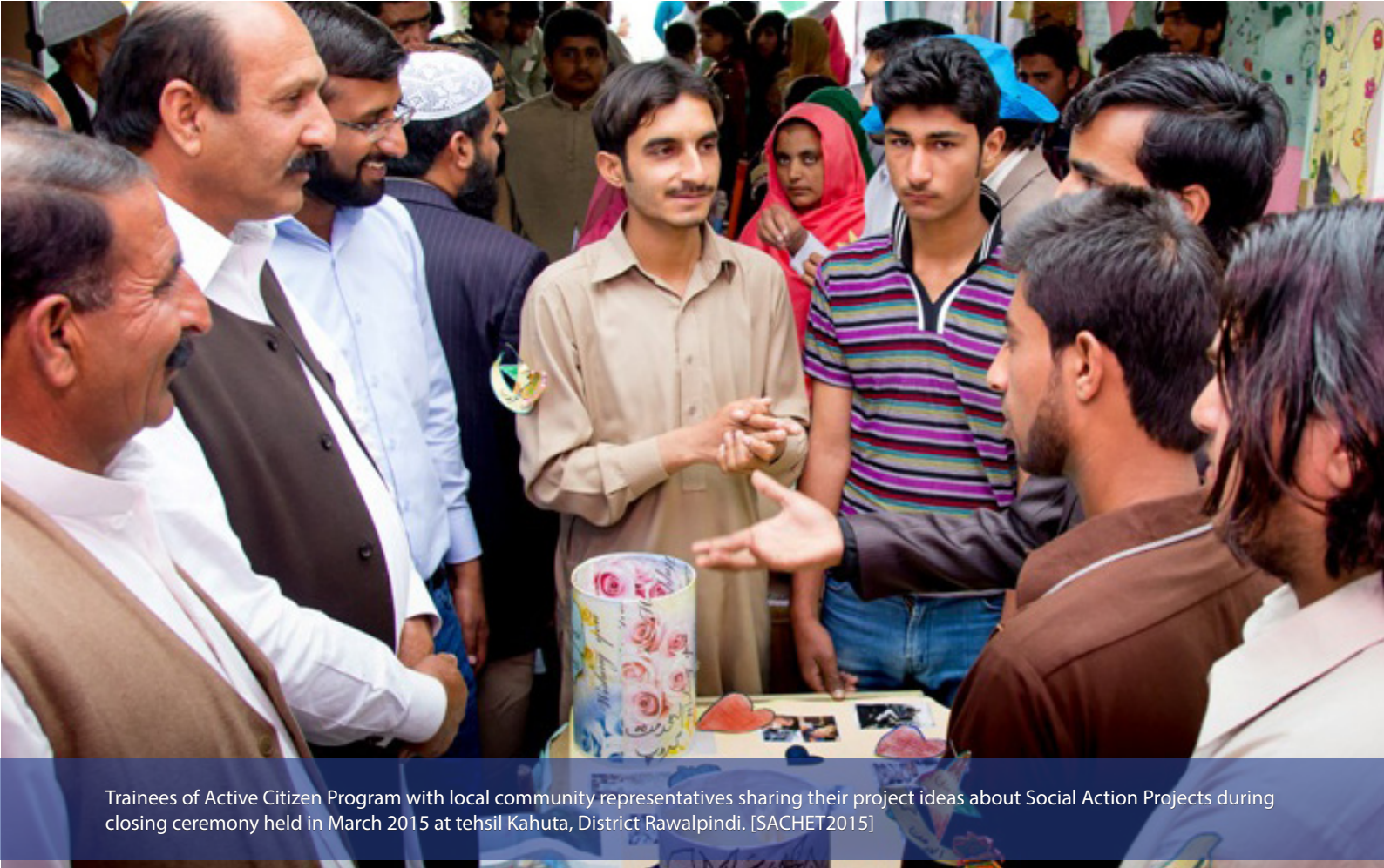
Trainees of Active Citizen Program with local community representatives sharing their project ideas about Social Action Projects during closing ceremony held in March 2015 at tehsil Kahuta, District Rawalpindi. [SACHET2015]