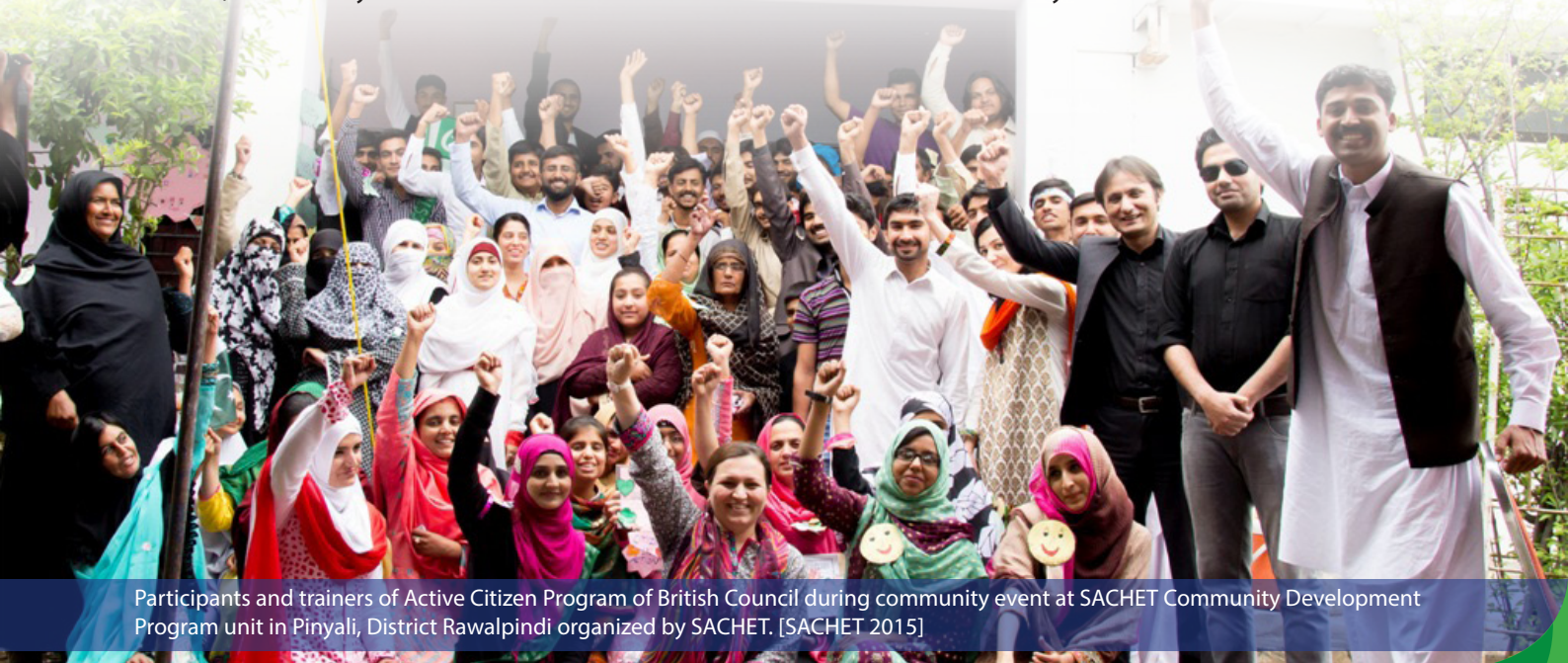
Participants and trainers of Active Citizen Program of British Council during community event at SACHET Community Development Program unit in Pinyali, District Rawalpindi organized by SACHET.

SACHET works in all regions and provinces of Pakistan. It has linkages with a large number of stakeholders including local and provincial governments, key duty bearers, civil society organizations, NGOs/CBOs, students and youth groups, media, academia and volunteers. SACHET is also a member of a number of vibrant social sector networks. The National Secretariat of nationwide network, PRHN (Pakistan Reproductive Health Network) is currently based in SACHET. The outreach of SACHET is thus country wide.