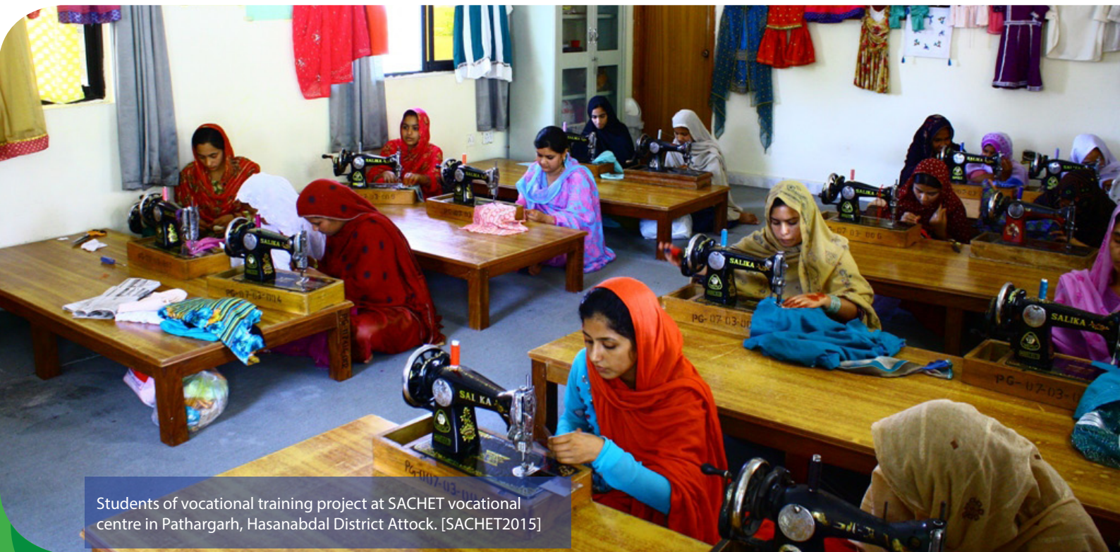
Students of vocational training project at SACHET vocational centre in Pathargarh, Hasanabdal District Attock. [SACHET2015]