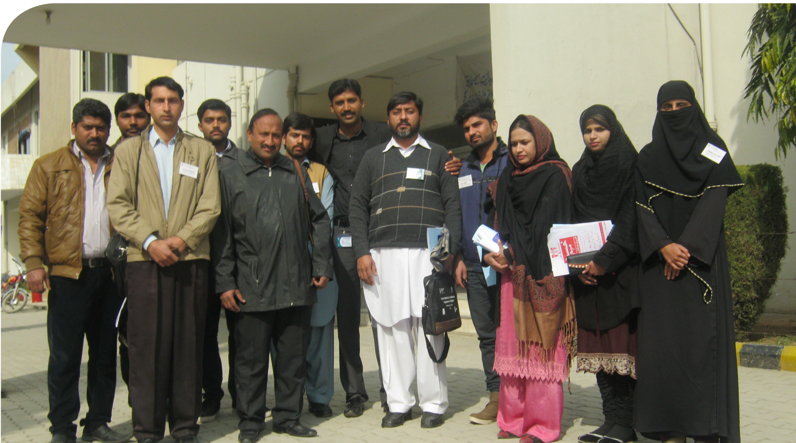
SACHET's vaccination team during anti-measles campaign, jointly implemented by Directorate of Health Services, CDA Islamabad and SACHET Pakistan in Jan-Feb 2015.